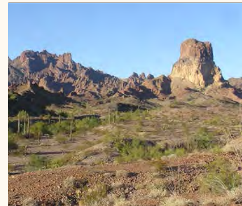
Top, Agave in bloom. Middle, Desert Tortoise. Bottom, Thumb Butte.

Please see the Public Use and Hunting Regulations leaflet for additional information about visitor activities and refuge regulations.