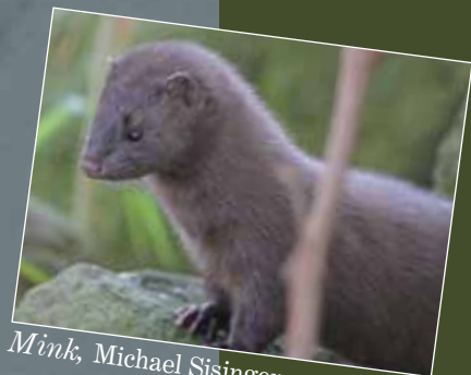
Mink, Michael Sisinger

One-quarter mile up the wood chipped portion of the Orange Trail that heads west toward West Jefferson Avenue is the start of the Green Trail. This rustic narrow trail traverses different habitat types. The first portion is dominated by dense stands of Drummond's dogwood, followed by an observation deck with a spotting scope in a black walnut grove. The deck overlooks the Humbug Marsh and the Detroit River. Follow the trail to an oak-hickory dominated forest that boasts of oak trees over 300 years old. Benches are located at the observation deck only.