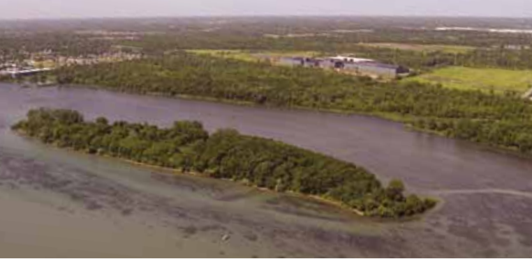
Humbug Marsh, BASF Corporation