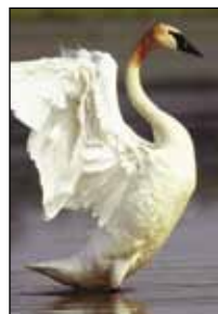
Trumpeter Swan, K. LeBlanc

The refuge was established in 2001 with 300 acres. As of 2010, the refuge manages over 5,700 acres in both Wayne and Monroe Counties. It is one of over 550 refuges in the National Wildlife Refuge System (NWRS). Managed by the U.S. Fish and Wildlife Service, the NWRS is the world's premier system of public lands and waters set aside to conserve America's fish, wildlife and plants. For more information on the U.S. Fish and Wildlife Service, please visit www.fws.gov .