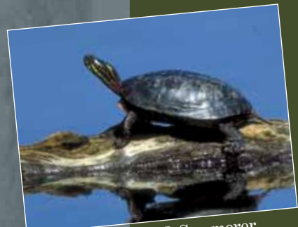
Painted Turtle, K. Sommerer