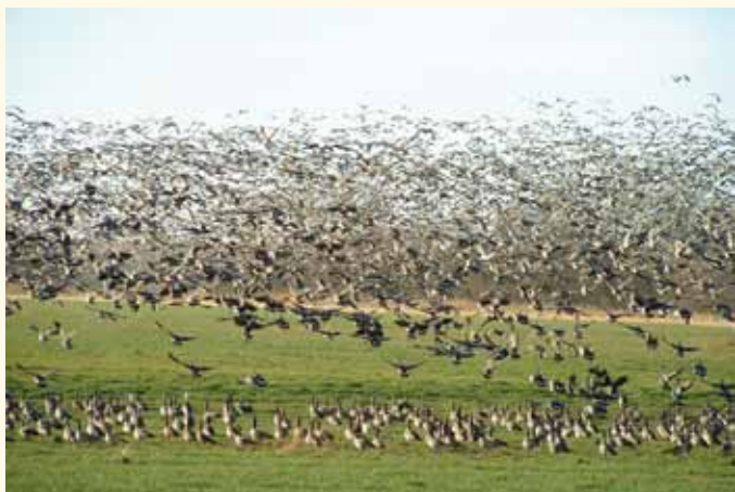
Geese feeding in refuge wheat field.