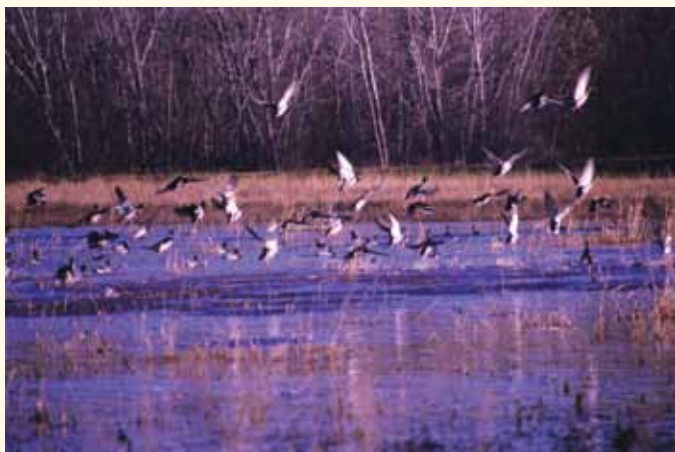
Ducks in the Moist Soil Unit.

Aldo Leopold could easily have been describing the more than 40,000 geese that punctuate the quiet beauty of the 8,075-acre Washita National Wildlife Refuge each winter. Within the refuge, the slow-moving Washita River winds through prairie and farmlands to merge with Foss Reservoir, providing a home and resting area for geese and other waterfowl. Gently rolling hills, ravines, and bottomlands laced with creeks shelter wildlife as common as white-tailed deer and as unusual as the Texas horned lizard, a state protected species.