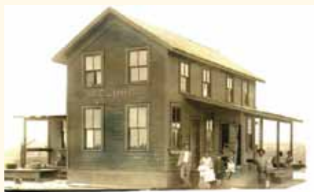
Railroad Section House, McClure, Oklahoma, circa 1916.

Remember, all archeological sites and finds are protected. Taking artifacts not only breaks the law, but destroys a story line connecting us to our past.