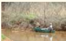
Fishing the Washita River.

Anglers enjoy fishing from shore or boat on the Washita River and upper end of Foss Reservoir. The sand bass spawning run in the Washita River in the spring attracts the most anglers. Shoreline fishing is open from the refuge boundary south of Lakeview Recreation Area all the way to the northwest boundary west of the McClure Recreation Area. All applicable state laws must be followed.