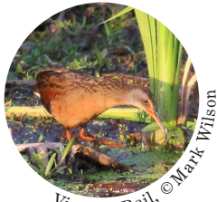
Virginia Rail

Use your ears, not just your eyes, on these special evening tours of the refuge. The refuge is closed from dusk to dawn, so this tour is a rare opportunity to experience it in the twilight and early evening hours when many animals are active.