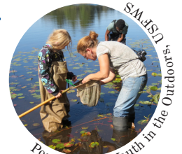
Pond Study - Youth in the Outdoors, USFWS

If you have kids, grandkids, friends with kids, or are a kid, and you want to participate send an email to seney@fws.gov to be added to our mailing list and registration materials will be sent to you in August. There will be several activities to choose from and scouts can earn badges or portions of badges.