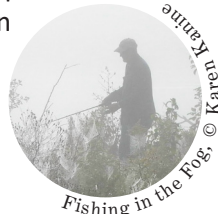
Fishing in the Pools

Looking to catch that big fish? Why not try a pool normally closed to fishing? If you love to fish don't miss out on the chance to fish E, C, D and portions of B Pools that are only open to fishing from Labor Day through Sept. 30 annually.