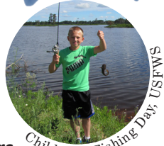
Children's Fishing Day, USFWS

Anglers ages 16 and under are welcome to participate. We provide poles and bait. Register at the Visitor Center before fishing. Activities and games begin at noon in the visitor center. A complimentary fish dinner for all participants and their families will be held at 3 pm, followed by an awards ceremony and random prize give away.