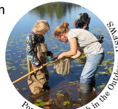
Pond Study - Youth in the Outdoors, SMJSD

If you have kids, grandkids, friends with kids, or are a kid, and you want to participate send an email to seney@fws.gov to be added to our mailing list and registration materials will be sent to you in August. There will be several activities to choose from and scouts can earn badges or portions of badges.