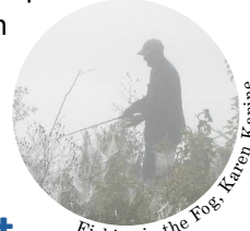
Fishing in the Pools, Karen Kamine

Looking to catch that big fish? Why not try a pool normally closed to fishing? If you love to fish don't miss out on the chance to fish E, C, D and portions of B Pools that are only open to fishing from Labor Day through Sept. 30 annually.