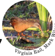
Virginia Rail

Meet other photographers and explore the refuge, look for great shots and share photos and skills.