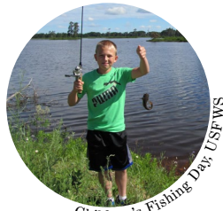
Children's Fishing Day

Anglers ages 16 and under are welcome to participate. We provide poles and bait. Register at the Visitor Center before fishing. Activities and games begin at noon in the visitor center. A complimentary fish dinner for all participants and their families will be held at 3 p.m., followed by an awards ceremony and random prize give away.