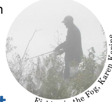
Fishing in the Pools, Karen Kamine

Looking to catch that big fish? Why not try a pool normally closed to fishing? If you love to fish don't miss out on the chance to fish E, C, D and portions of B Pools that are only open to fishing from Labor Day through Sept. 30 annually.