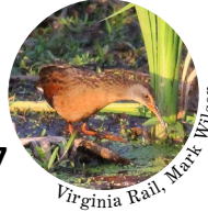
Virginia Rail

Meet other photographers and explore the refuge, look for great shots and share photos and skills.