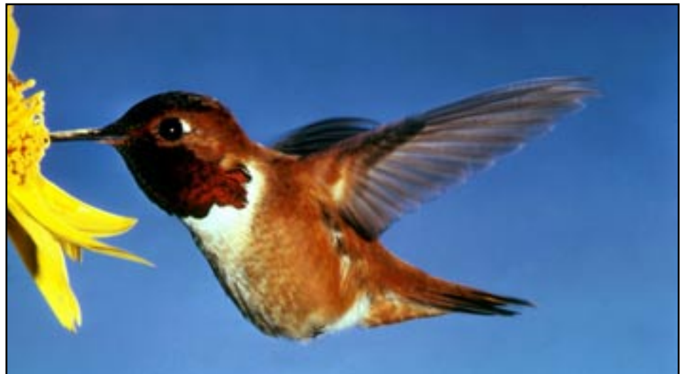
The rufous hummingbird is an important pollinator species.

hummingbirds do not smell. Butterflies prefer flowers with flat open surfaces and flowers that smell like rotting flesh attract flies. Some flowers, like snapdragons, only attract insects that have the ability to open the specialized parts to access the stamen and stigma. Pollinators that are generalists can pollinate several species of plants, while specialists are restricted to one plant. These extraordinary relationships have resulted in maintaining ecosystem