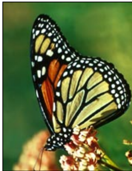
Monarch butterflies pollinate many, if not all, 108 species of milkweed in North America .

The monarch butterfly is another species important for pollination. It is the