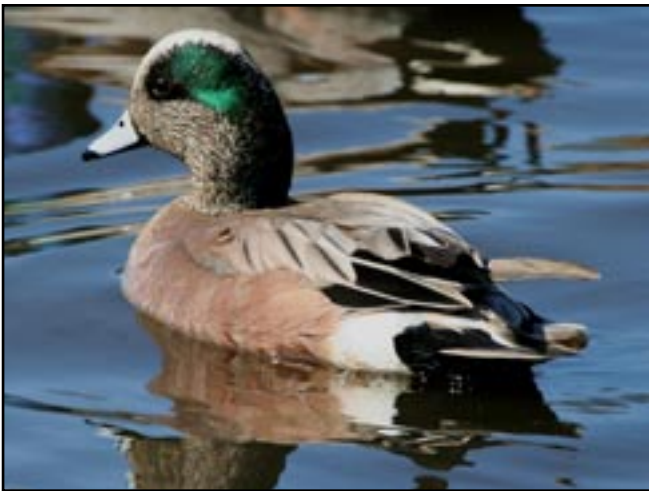
American Wigeon.

For More information on trails, contact the Don Edwards San Francisco Bay National Wildlife Refuge Visitor Center, Tuesday through Sunday, 10:00 a.m. – 5:00 p.m. or call 510-792-0222 ext. 43.