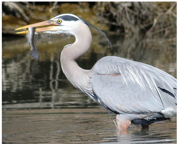
Right: Great Blue Heron

South Parking Lot and Trailhead: Follow directions above. Instead of turning right toward West Warren Ave., continue straight on Fremont Blvd. for 1.5 additional miles. There is a parking lot on the left adjacent to 48481 Fremont Blvd.