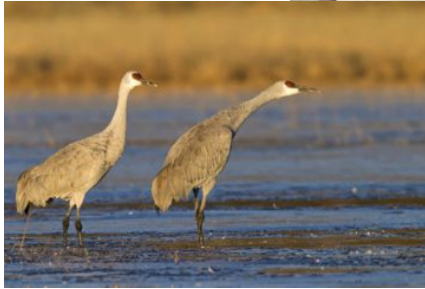
Birdwatchers are encouraged to visit the Llano Seco Unit when in search of sandhill cranes