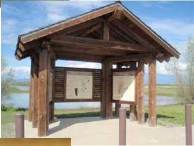
Learn about the historic Rancho Llano Seco at the Information Kiosk