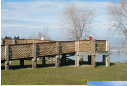
Observation Deck at the Visitor Area overlooks the surrounding wetlands

The Llano Seco Unit has a small Visitor Area with a parking lot, restroom, information kiosk, observation deck and trailhead.