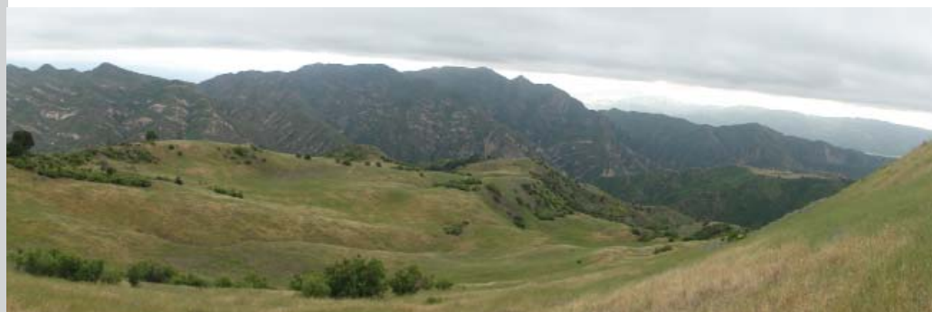
Hopper Mountain National Wildlife Refuge.