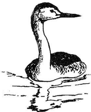
Western Grebe

124 bird species have been recorded on the Innoko Refuge. This list describes their abundance and status.