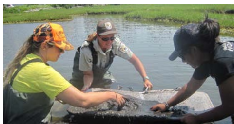
Staff and interns sample fish in the salt marsh.

call the Refuge Office at (207) 646-9226 or send an email to kate_obrien@fws.gov