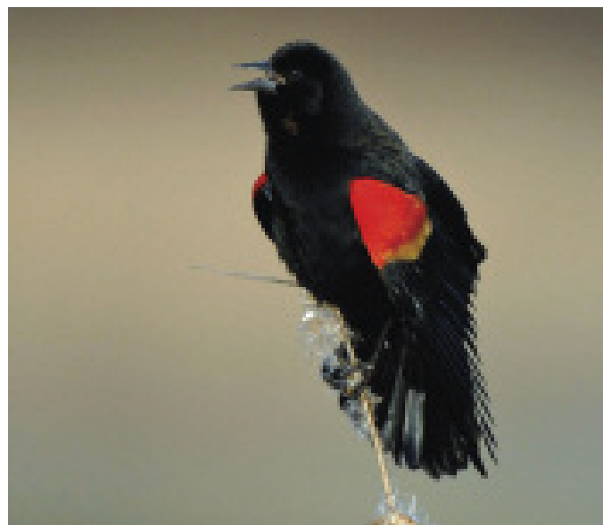
Red-winged blackbird (male)