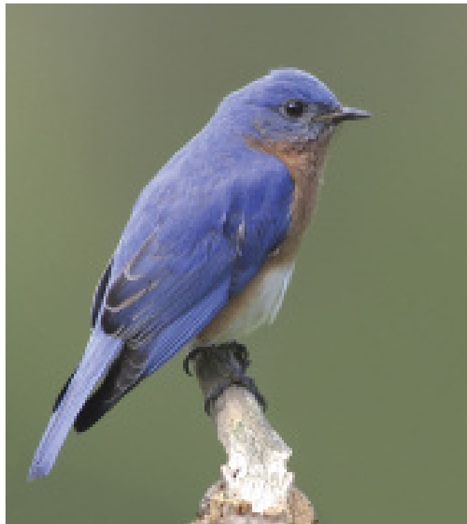
Eastern bluebird (male)