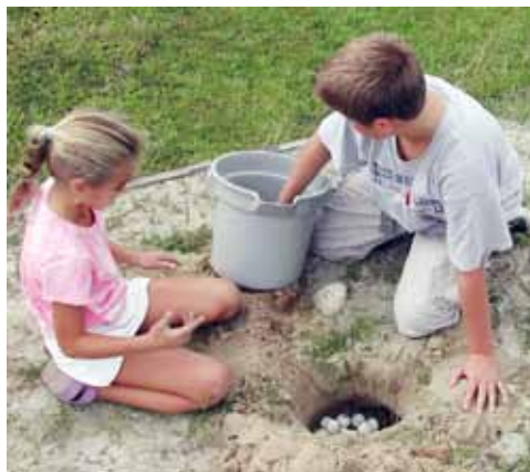
In the Sewee Visitor & Environmental Education Center sandbox, children pretending to be biologists, dig up a Loggerhead sea turtle nest, photo by Julie Binz.

of nesting habitat in coastal areas, and its effect on shorebirds.