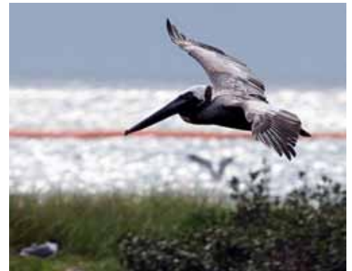
A Brown pelican flies by a containment boom at Breton NWR.

On April 20, 2010, forty-one miles off the coast of Louisiana, the Deepwater Horizon drilling rig exploded, creating what has become one of the worst environmental catastrophes in United States history. The rig was drilling an exploratory well at the Mississippi Canyon, an underwater landform about 5,000 feet below sea level, when highly pressurized methane gas ignited, causing an explosion on the rig, the eventual sinking of the rig, and the tragic loss of 11 lives.