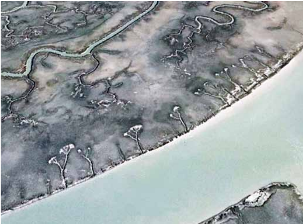
Rapidly advancing tidal creeks are dissecting Cape Romain's salt marsh.