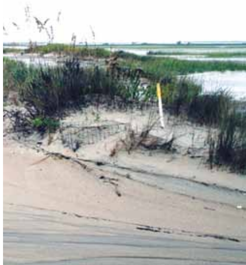
A Loggerhead nest barely escapes overwash from the high spring tides.

In years past refuge staff ordered aerial flights of the refuge so that they could compare photographs from year to year. Aerial images provide snapshots in time that offer a unique perspective on the changes over time. When GIS technology became readily available, it was hailed as a blue ribbon management tool because that is when managers were able to make accurate measurements of the refuge's