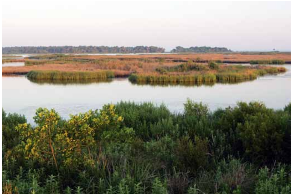
Jacks Pond is the largest managed impoundment on Bulls Island.

The perimeter levee that forms Jacks Pond is only yards away from the eroding shoreline. At the current rate of erosion, the refuge could lose the levee in about three years, or sooner with a major storm. When the levee goes, the impoundment is likely to revert to a saltwater bay with