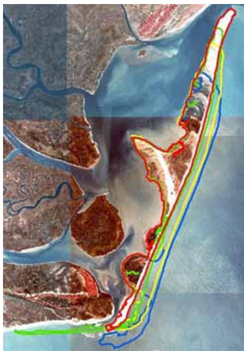
Shoreline loss on Cape Island since 1954 (blue), 1979 (yellow), and 1994 (green). 2006 aerial photograph courtesy of the South Carolina Department of Natural Resources.

High relative sea level rise in the Cape Romain area contributes to higher tides which accelerate erosion rates. Many other factors are also linked to barrier island changes, including sediment disruption from dams in the watershed, wind and waves from storm events, and the stark vulnerability of low-lying barrier islands. Today, thanks to GIS technology, managers can predict where those losses are expected to occur, calculate how many linear feet of shoreline the islands will lose, and factor those changes into decisions regarding their management strategies for refuge species.