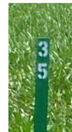
HUNT SITE MARKER example