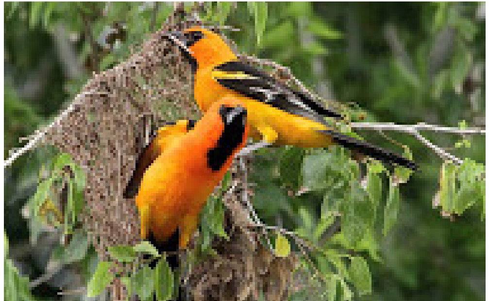
Altamira orioles.