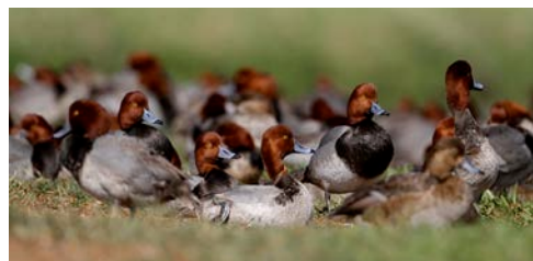
Redhead ducks.

The Visitor Center has an eBird Trail Tracker for you to record your finds and to discover what others have been seeing. So Good Birding! And be sure to let us know if you find an accidental, hypothetical or unlisted bird. If it's really rare, remember a picture is worth a thousand words. This list is in accordance with the seventh addition of the American Ornithologists' Union Checklist of North American Birds, (1998) and the 53rd supplement (July 2012).