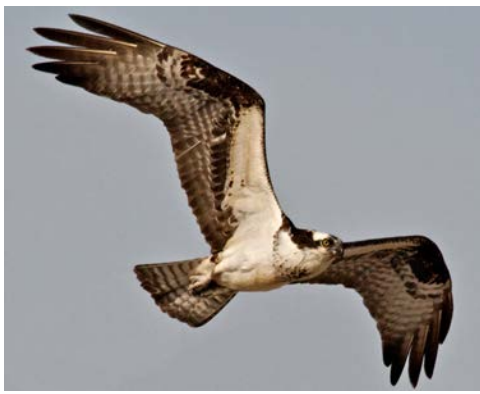
Osprey.