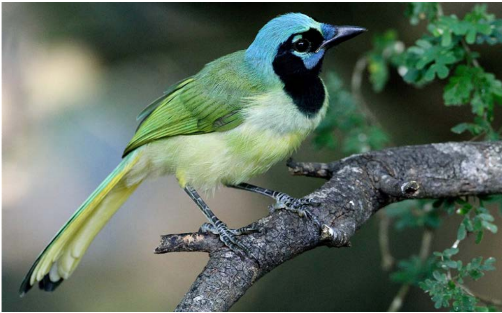
Green Jay.