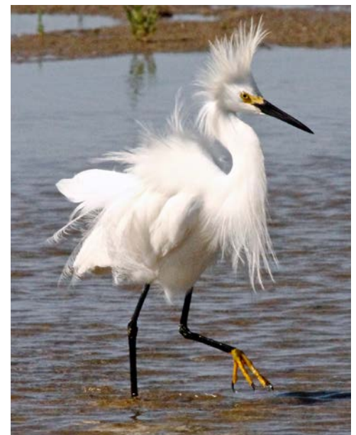
Snowy egret.