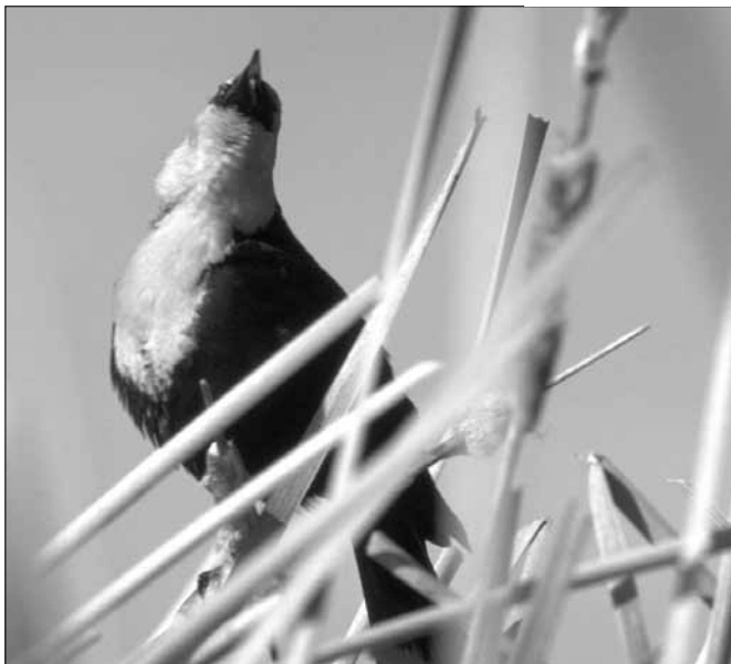
Yellow-headed Blackbird