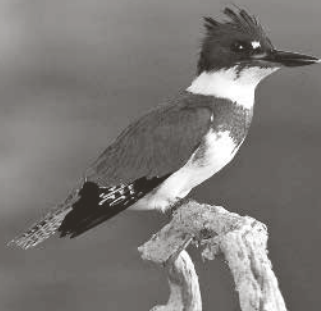
Belted kingfisher