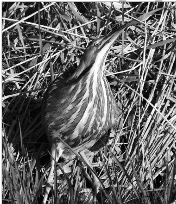
American Bittern

Black-bellied Plover u o u American Golden-Plover u r u Snowy Plover r Semipalmated Plover u u u Piping Plover# • r r Killdeer • c c c