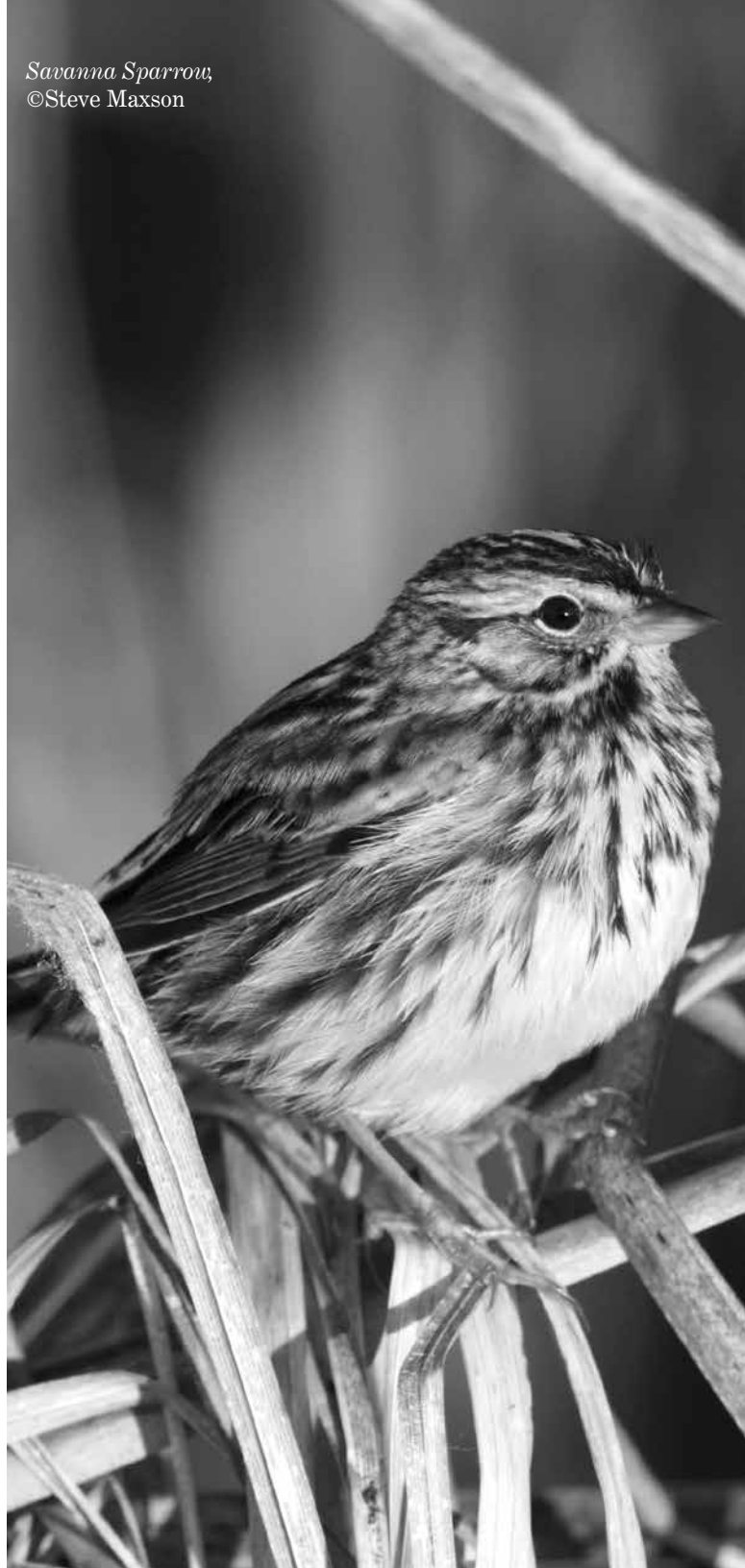
Savanna Sparrow

Gray Catbird • ..... c c c c Brown Thrasher • ..... u u u u Sage Thrasher ..... r Northern Mockingbird ..... o