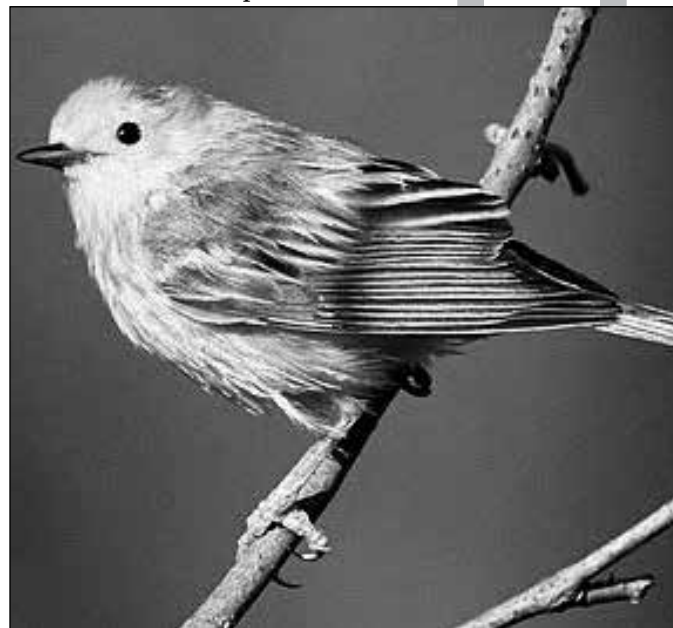
Yellow Warbler; Ivars Kraft

Spotted Sandpiper • c c c Solitary Sandpiper u o u Greater Yellowlegs u o u Willet o o o Lesser Yellowlegs c u c Upland Sandpiper • o o Whimbrel r Hudsonian Godwit u o Marbled Godwit • c c o Ruddy Turnstone u r u Red Knot o o Sanderling o r u Semipalmated Sandpiper c u c Western Sandpiper r Least Sandpiper c u c White-rumped Sandpiper u u r Baird's Sandpiper u o u Pectoral Sandpiper c u c Dunlin u o u Stilt Sandpiper o o u Buff-breasted Sandpiper r r o Ruff r Short-billed Dowitcher u u o Long-billed Dowitcher u u Wilson's Snipe • c c c American Woodcock • u u u Wilson's Phalarope • # u u u Red-necked Phalarope o o u