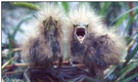
American Bittern

This site provides access to approximately 3 miles of river channel bordered by bald cypress, river birch, and other floodplain forest trees. A silt bar on the east end and the Ohio River floodgate on the west end maintain water in the channel most of the year. The access is located off Highway 51 and Redmond Road and provides opportunities to fish and watch wildlife.