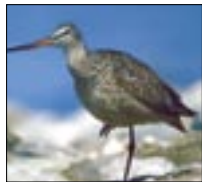
Marbled Godwit, J. Mattsson

Frank Bellrose Wildlife Viewing Area (USFWS) Dedicated to internationally known waterfowl biologist, this viewing area provides year-round access to the Bellrose Waterfowl Reserve for wildlife watching. The Bellrose Reserve is managed specifically for waterfowl and shorebirds but also provides important habitat for deer, beaver, mink, kingfishers, and a variety of wading birds. The site is located off Cache Chapel Road.