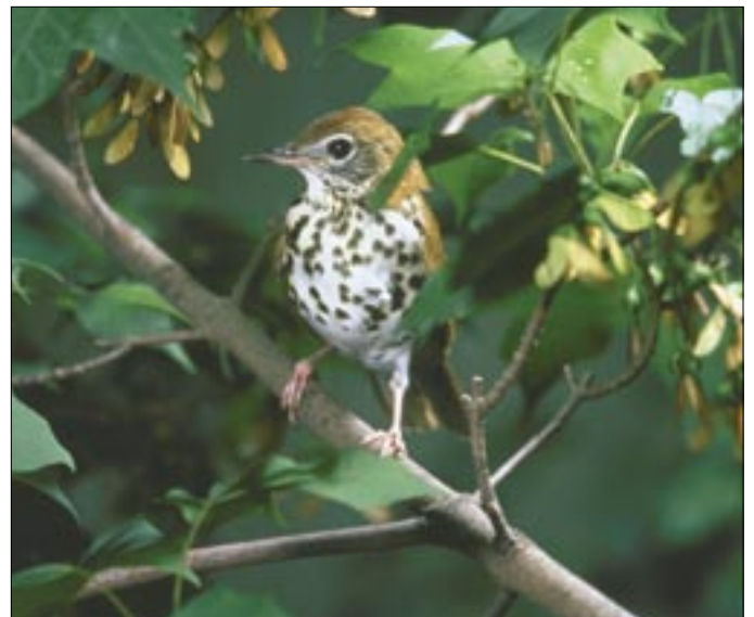
Wood Thrush, S. Maslowski