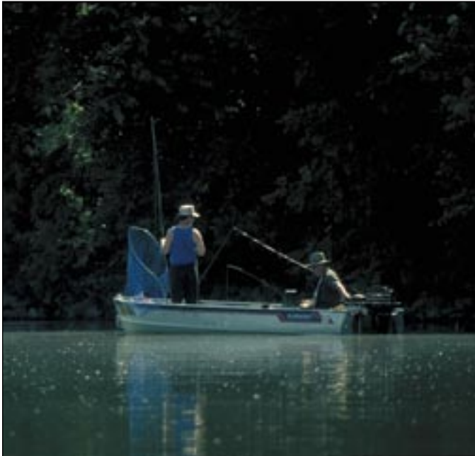
Fishing!, G. Gage, USFWS

Refuge hunting and fishing seasons generally follow state seasons and regulations. It is important to note an annual permit is required and needs to be signed and on the person while hunting or fishing on refuge property. This permit is free and located on the Refuge Hunting and Fishing brochure; additional information and refuge specific regulations are also described in this publication. Cypress Creek National Wildlife Refuge Hunting and Fishing brochures are available at the refuge office, outdoor kiosks, Wetlands Center, or on the Cypress Creek web-site ( www.fws.gov/midwest/cypresscreek )