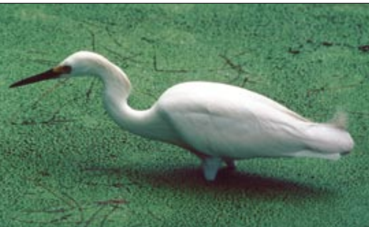
Cypress Trees, M. Jeffords ©