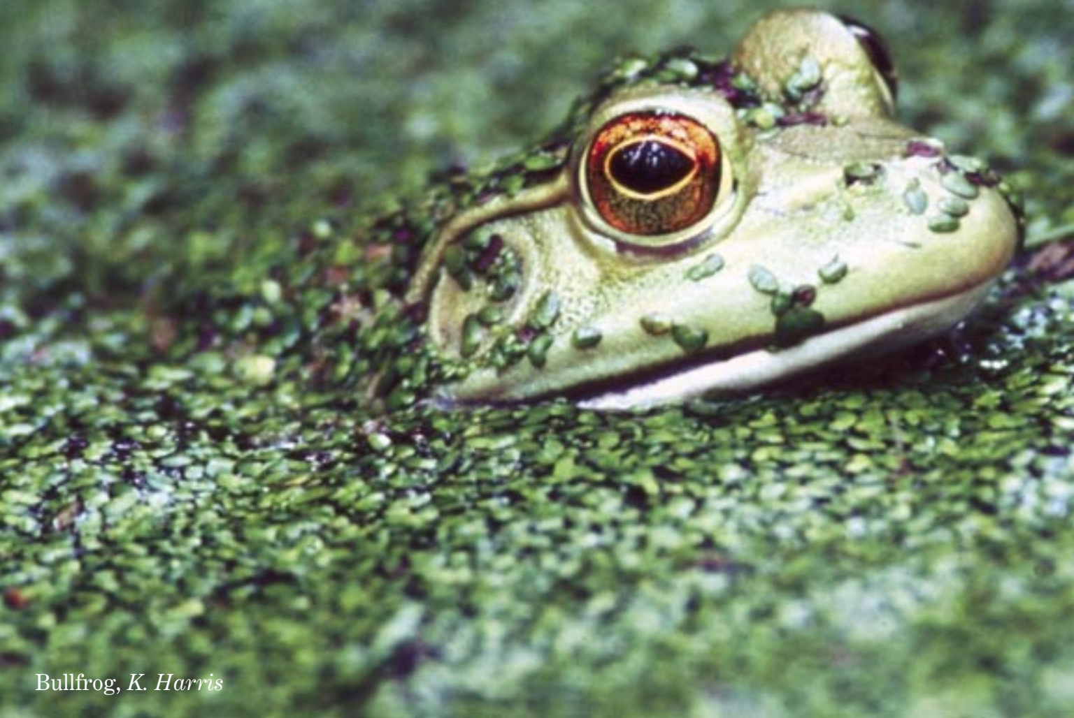
Bullfrog