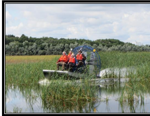
Airboat Ride on Audubon Refuge