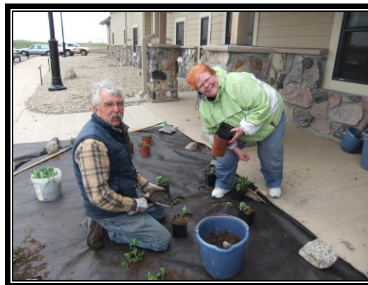
Planting Native Wildflowers

Audubon NWR provides food, water, shelter, and space for a variety of wildlife species. Refuge managers focus their efforts on managing the land to meet the needs of waterfowl and other migratory birds, threatened and endangered species, and resident wildlife.