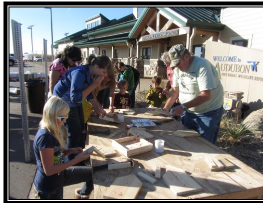
Building Bird Feeders with Youth