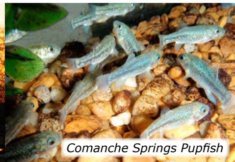
Comanche Springs Pupfish