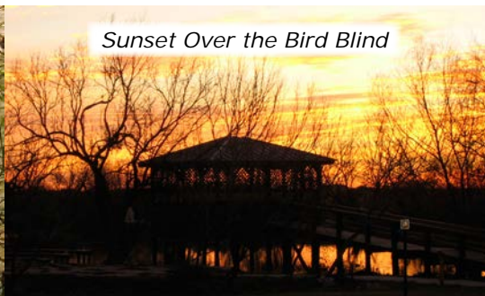
Sunset Over the Bird Blind