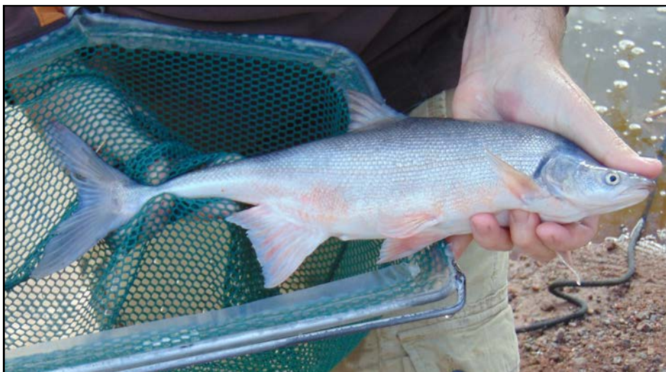
Bonytail chub captured in Office Cove on Bill Williams National Wildlife Refuge in November 2015. This fish was presumably stocked in 2006.