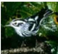
Black & White Warbler