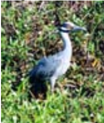
Yellow-crowned night Heron