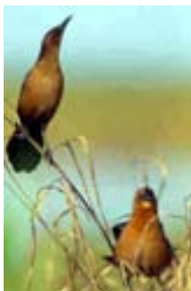
Female Boat-tailed Grackles

To report unusual sightings, or for further information, contact: