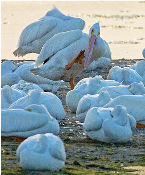
White pelicans

A maze of mangrove islands and narrow waterways serve as the nursery for many plants, animals and fish and define the area known as Ten Thousand Islands National Wildlife Refuge. The 35,000-acre refuge provides vital habitat for all kinds of protected plants and animals. Nearly 200 fish species have been documented in the waters, which are also home to several endangered species including the West Indian Manatee, Snail Kite, Peregrine Falcon, Wood Stork, and the Atlantic Loggerhead, Green, and Kemp's Ridley sea turtles. Many of the nearly 200 species of birds that use the refuge are migratory and use the mangrove islands to protect them from storms, as feeding grounds, and to simply rest during their long migrations. Throughout the year, visitors can expect to see herons, egrets, manatees, raccoons, river otters, and bottle-nosed dolphins.