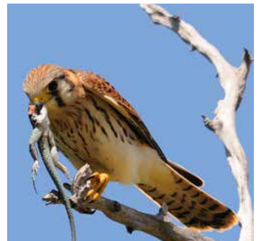
Falconcito/American Kestrel