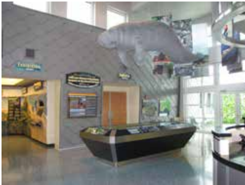
Centro de visitantes/Visitor Center