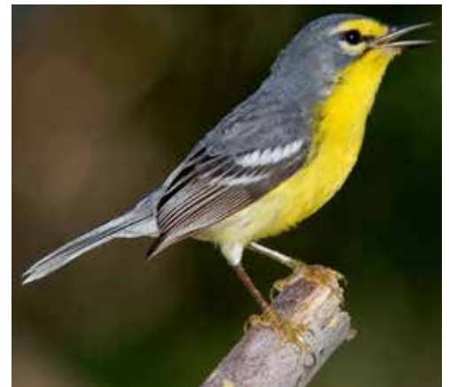
Reinita mariposera/Adelaide's Warbler