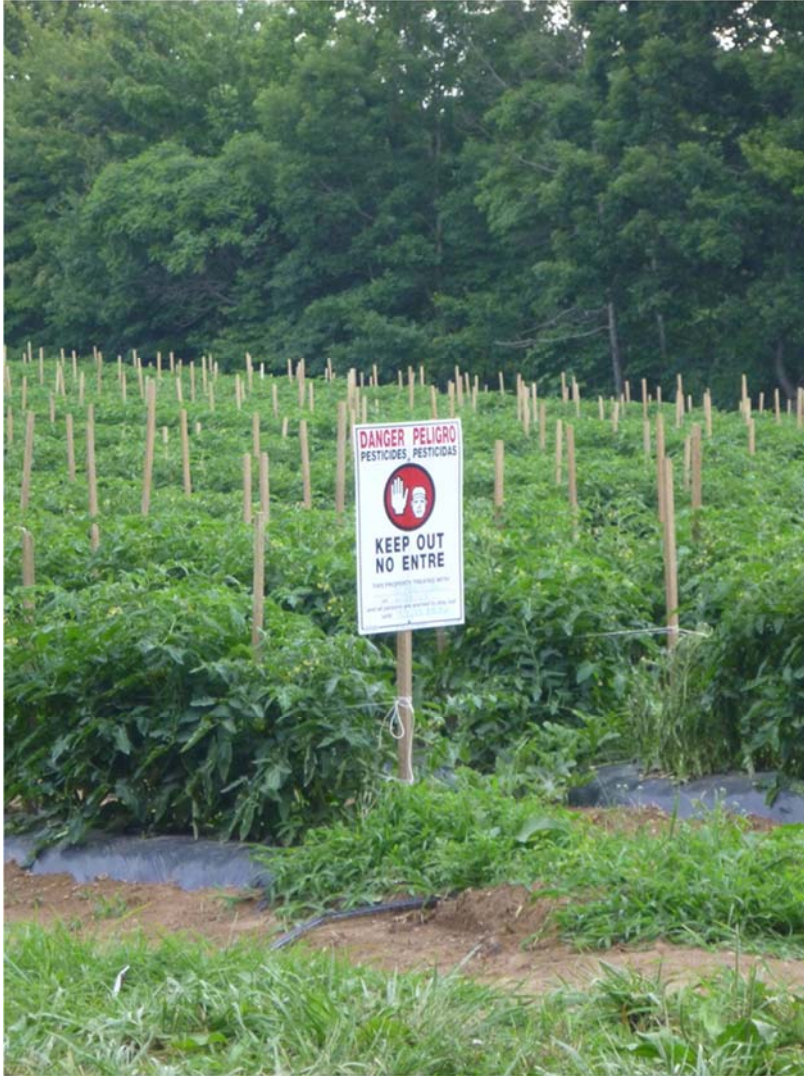
Figure 3. Tomato farm with warning sign about pesticide use in upper Youngs Creek watershed, Bledsoe County, TN.

An emerging threat to laurel dace is the loss of hemlocks from riparian areas due to the hemlock woolly adelgid ( Adelges tsugae ) (HWA), a nonnative insect that infests hemlocks, causing damage or death to trees. HWA increases mortality rates for hemlocks in the southern Appalachians; in North Carolina, more than 85% of infested trees were dead seven years following infestation (Ford et al. 2012). HWA was documented on Walden Ridge in Rhea County in 2008 and Bledsoe County in 2013, with likely infestation of hemlock in riparian forests along laurel dace streams in the future (Johnson pers. comm. 2013). All three watersheds containing laurel dace have known HWA infestations from US Highway 27 up Walden Ridge (D. Godbee pers. comm. 2013), but only hemlocks on state lands have been mapped so far (D. Lincicome pers. comm. 2013).