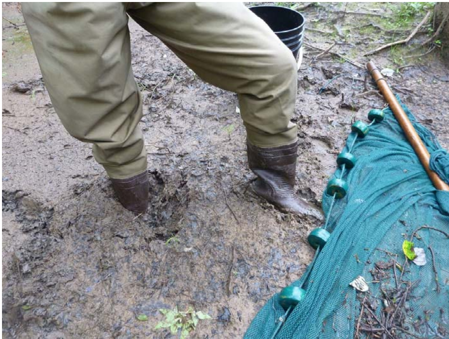
Figure 4. (a) Newly installed culverts at most downstream Summer City Road crossing on Moccasin Creek. (b) Silt deposition upstream of middle road crossing of Summer City Road and Moccasin Creek, Bledsoe County, TN.

In 2009, coal exploration drilling was done near Horn Branch in the Rock Creek watershed to determine if mining is feasible in this area, and a permit application for drilling was subsequently denied due to deficiencies in the application that were not addressed by the company (Effler pers. comm. 2013). Coal mining could still be approved in the watershed with an appropriate application; therefore, coal mining is a potential threat to this species.