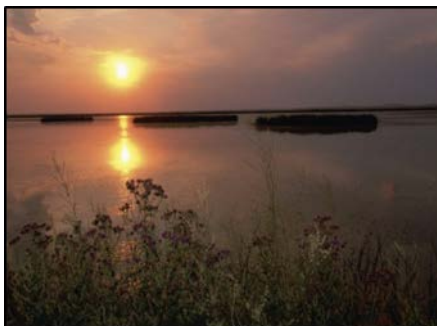
Benton Lake NWR

Hydrogeomorphic (HGM) analysis is a three-step process used to evaluate riparian and wetland ecosystems and surrounding landscapes. It is used to identify options for restoring areas to their original functions, before human-induced alterations, all within the context of landscape-scale conservation and species preservation.