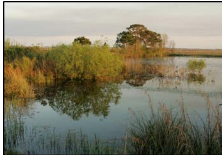
Wetland habitat

HGM analyses help to insure that such restorations will be successful by matching restoration strategies with the historical conditions of the targeted ecosystems.