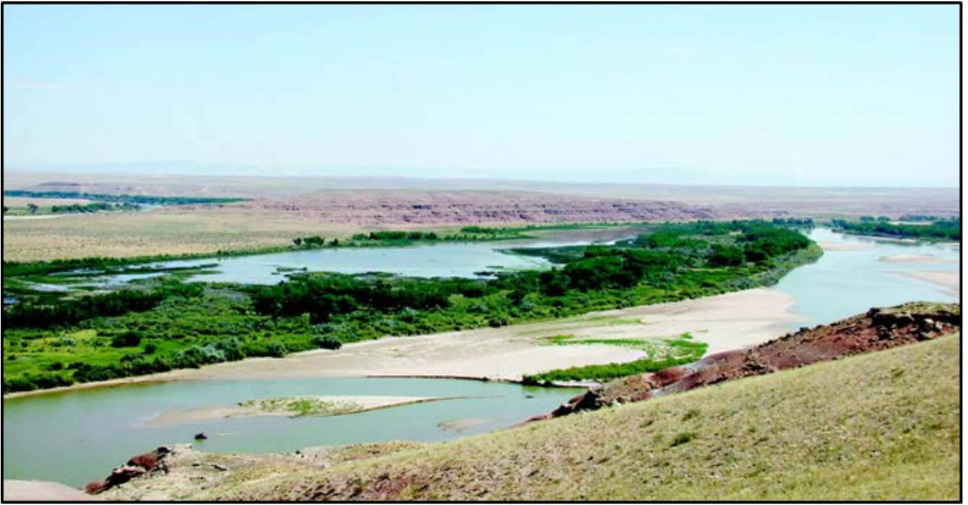
Ouray NWR, Credit: USFWS

The third step is to identify strategies for restoring an area to the historical condition within the context of the larger landscape.