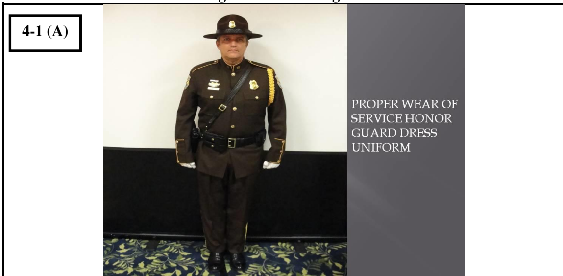
Figures 4-1A through D

*See Figures 4-1A through D below for a description and demonstration of the proper way to wear the SHG uniform.