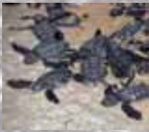
Green sea turtle

All other mammals were introduced by man to the island and include the house mouse, black rat, small Indian mongoose and domestic animals such as cattle, horses, dogs and cats.