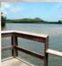
Fishing pier at Kiani Lagoon