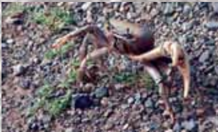
Common Land Crab

Various species of crustaceans are known to occur in the coastal waters and in near shore marine