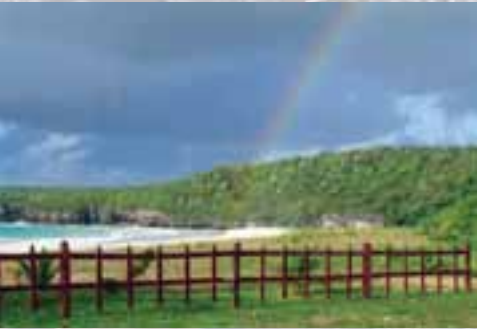
Playa Caracas Refuge east side

ecological value, the refuge contains important archeological and historic resources, including artifacts of the aboriginal Taino culture and the island’s sugar cane plantation era.