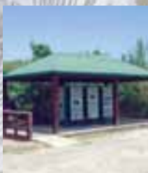
Kiani Lagoon kiosk and boardwalk