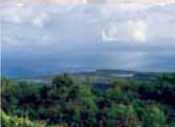
Vieques NWR west view