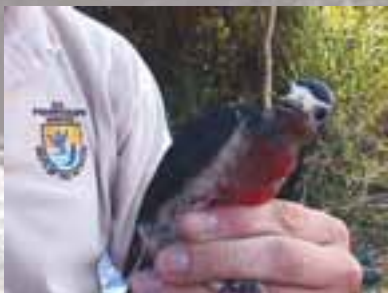
Bird banding project