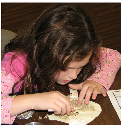
Wildlife discovery