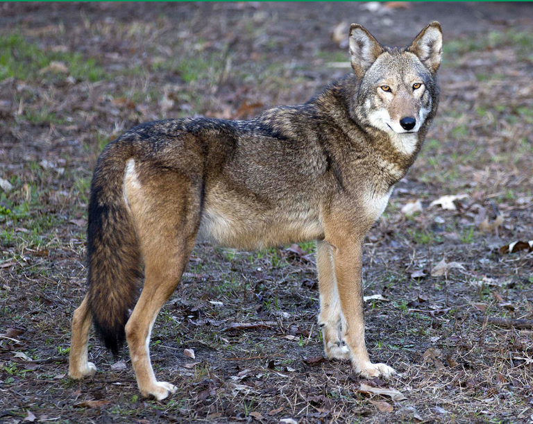
Red wolf (Canis rufus), credit: Lawrence l'Anson