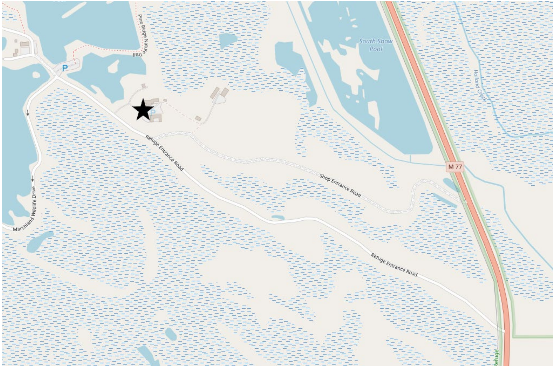
Graphic 2: The location of the shop on the Refuge Entrance Road.