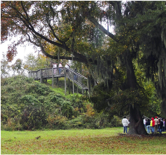
Indian mound