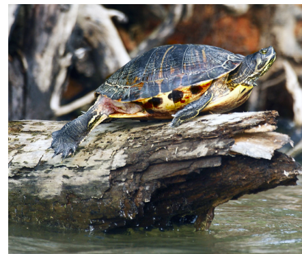
Yellow-bellied slider

Swimming or wading is not permitted in any refuge waters including the Scott's Lake fishing area.