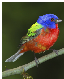
Above: tree swallow in box by Woody Tilley; below: painted bunting by Ken Jenkins