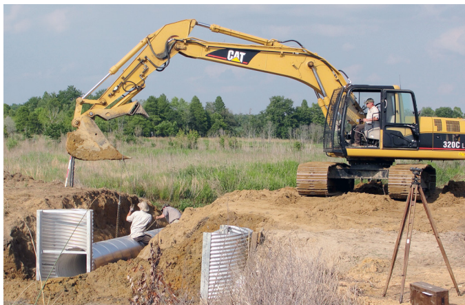
Installing a water control structure