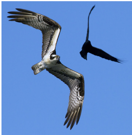
Osprey in flight

This calendar is meant to provide visitors with a general guide to seasonal wildlife events. Weather may cause slight variations. The best time to observe wildlife is dawn and dusk. Wildlife photography is encouraged throughout the year.