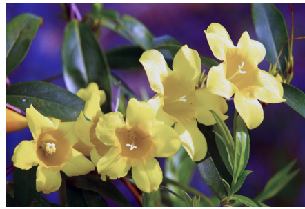
Yellow jasmine

Layered clothing during cool months and the use of insect repellent during warm months are recommended.