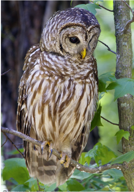
Barred owl by Woody Tilley

Visitors are encouraged to stop by the Visitor Center for current information on access and seasonally closed areas. Visitor access on all refuge units may be seasonally limited to provide total sanctuary for wintering ducks and geese.