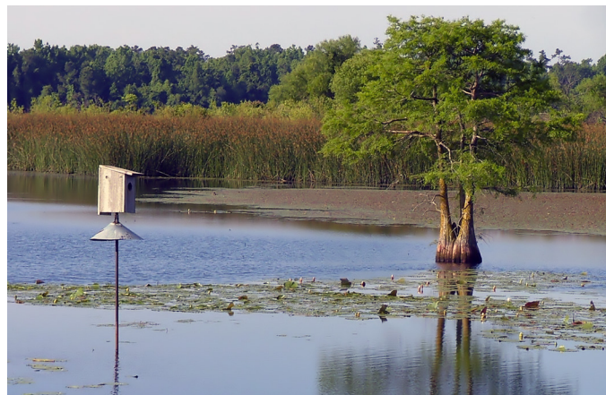
Wood duck box by USFWS

The managed freshwater marsh program is more complex. Water levels are adjusted to provide maximum benefits for wildlife. In