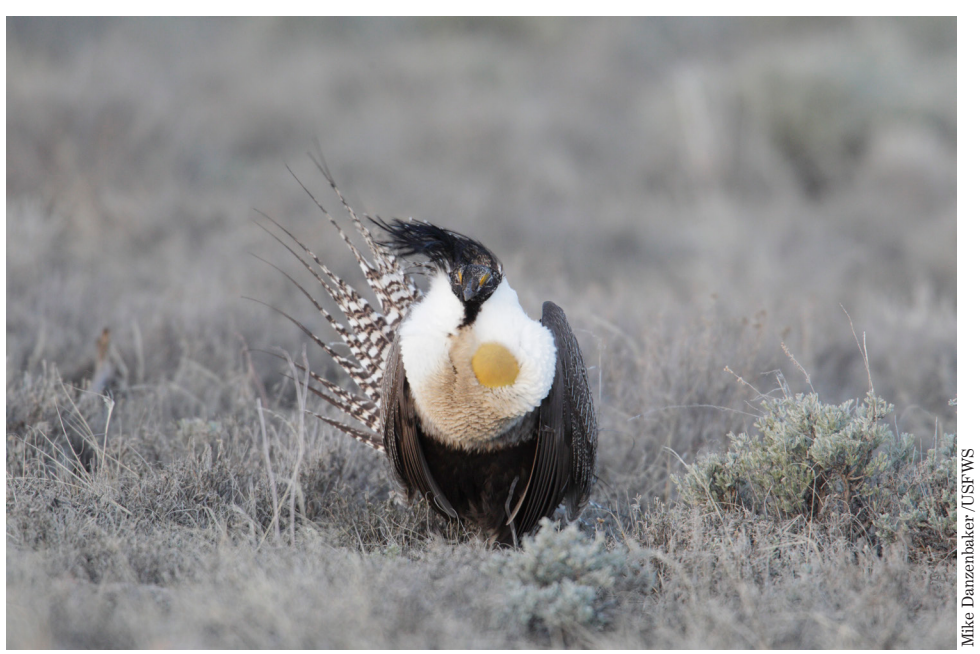
Gunnison sage grouse.

The foundation supporting recovery plans is a Species Status Assessment (SSA). A SSA includes much of the information and analyses previously