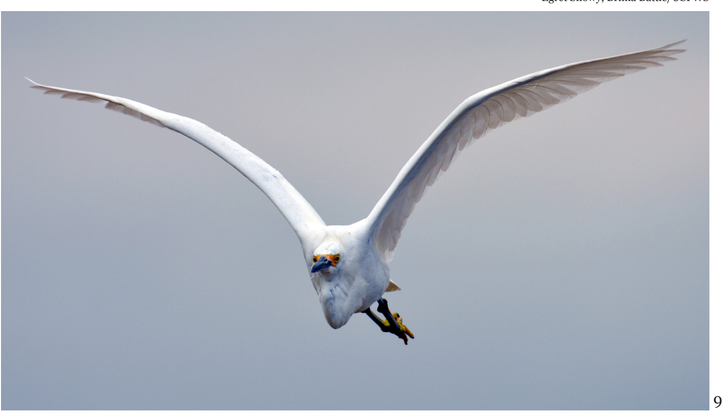
Egret Snowy