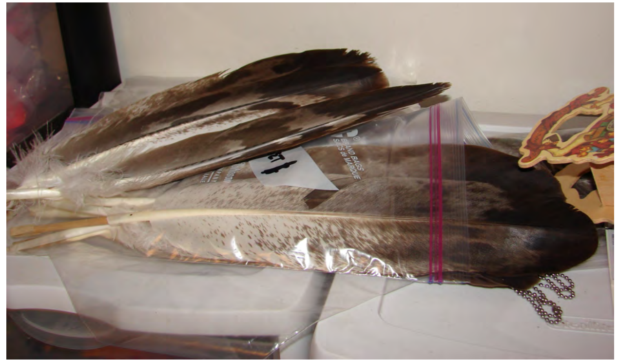
Golden eagle feathers packaged for sale on the black market by feather traffickers were discovered during the investigation by FWS LE agents.