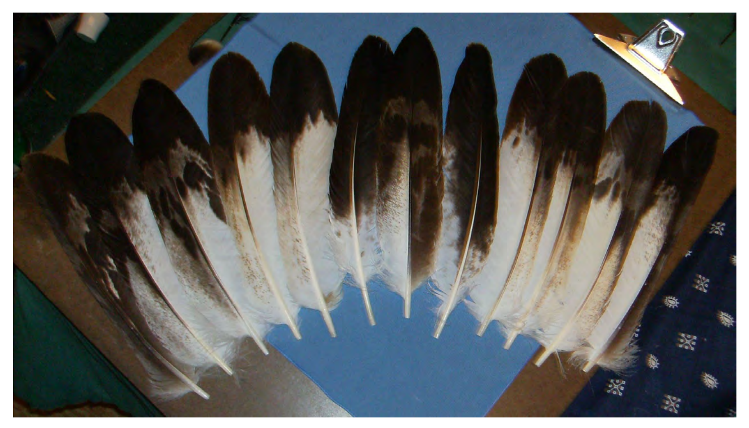
For a list of avian species protected by the Migratory Bird Treaty Act as of 2013, visit: www.fws.gov/migratorybirds/