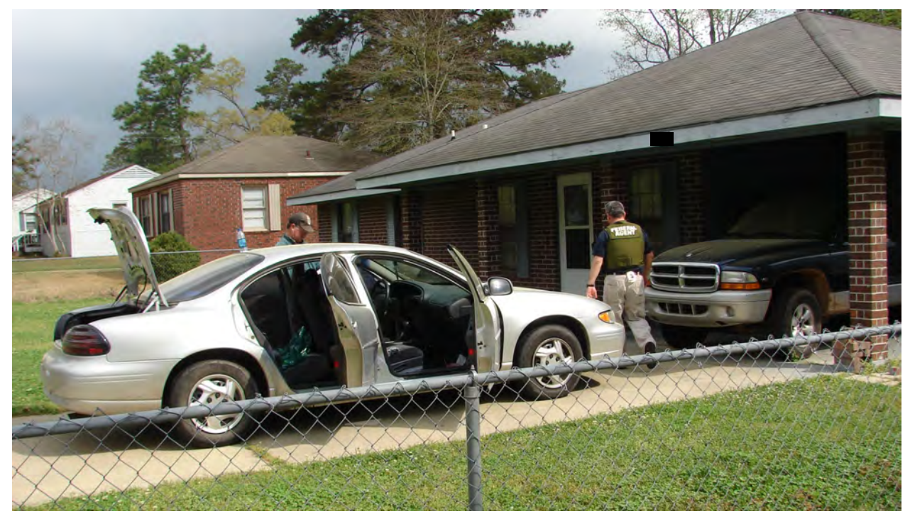
FWS officers serving a federal search warrant at the residence of a suspected feather trafficker.