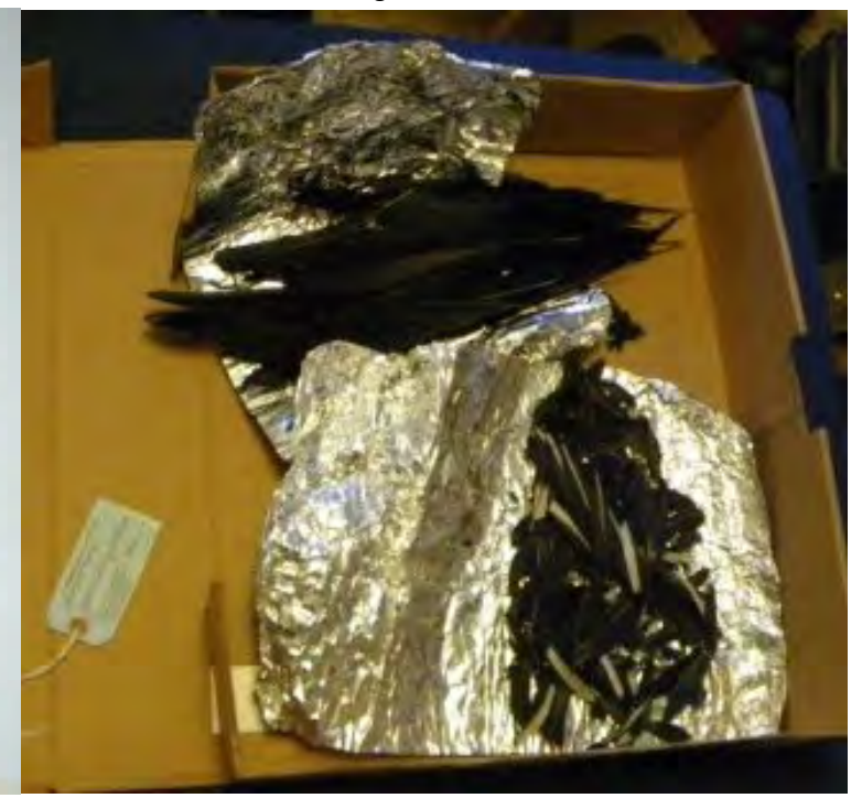
Bottom right—Anhinga tail feathers numbered for sale on the black market. Hawk tail feathers were found in protective sleeves in preparation for illegal trade.