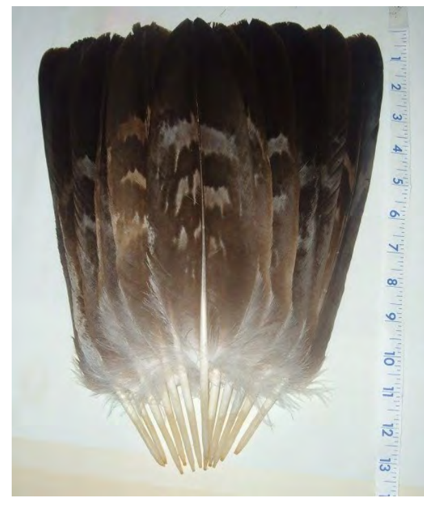
Bottom left—Anhinga tail feathers. Each anhinga tail represents one anhinga that was shot in the Everglades for its twelve tail feathers.

Photo right—The hackles (neck feathers) and other feathers from Anhingas.