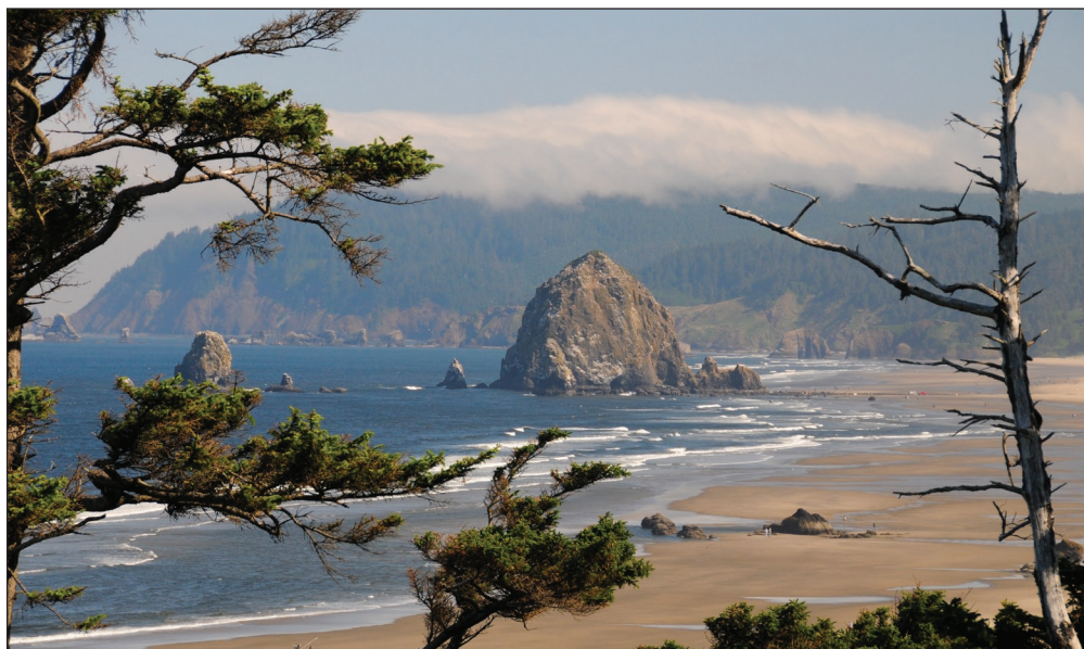
Haystack Rock, Oregon Islands NWR - a large seabird nesting colony

Climate change is one of the greatest environmental and conservation challenges of the 21st Century. The impacts of climate change will exacerbate existing stressors on our landscapes, fish and wildlife, and natural and cultural resources. Expected physical changes include rising mean sea level, widespread melting of snow and ice, changes in ocean currents and precipitation patterns, ocean acidification, and increased coastal erosion and flooding rates.