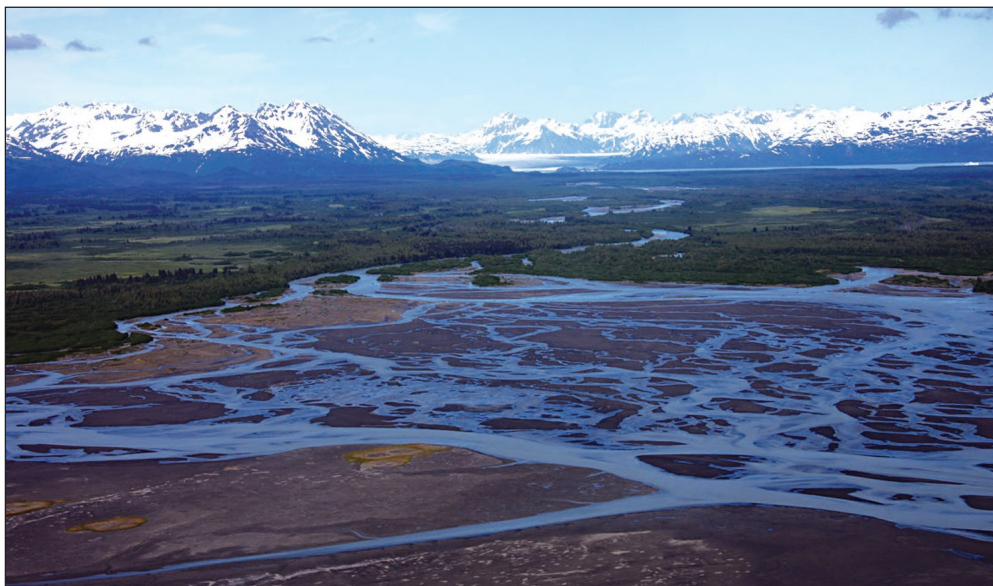
Dangerous River with Harlequin Lake and Yakutat Glacier in the background.

http://www.fws.gov/pacific/climatechange/lcc.html