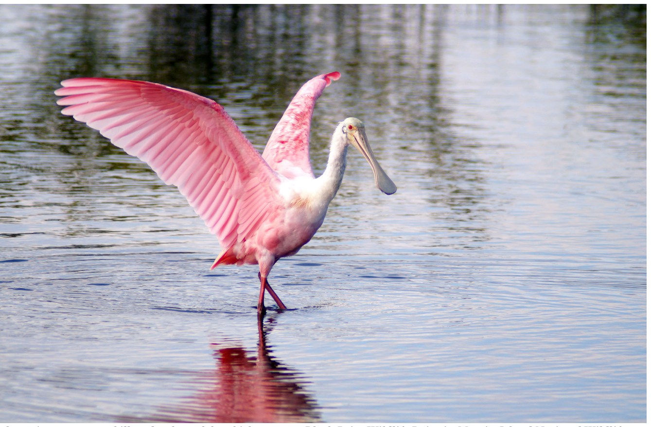
photo: A roseate spoonbill wades through brackish water on Black Point Wildlife Drive in Merritt Island National Wildlife Refuge.

This 7-mile, one-way drive travels through salt and freshwater marshes and is located on SR 406, one mile east of the intersection of SR 402 and SR 406. A $10.00 Refuge Daily Pass is sold on an honor system at the drive's entrance. Pick up an auto tour brochure at the drive's entrance or at the Refuge Visitor Center. The brochure includes numbered stops describing the natural history and management of the area. Wading birds, shorebirds, raptors, waterfowl, alligators, otters and other wildlife species can be observed. The Wild Bird Trail (1/4 mile round trip) is located at Stop # 4. Located at Stop #9 are: parking lot, restrooms, observation tower, wheel chair accessible platform, and the trail head to Cruickshank Trail (five mile loop).