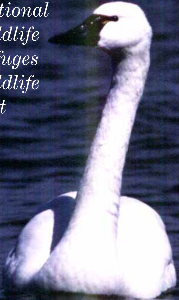
tundra swan