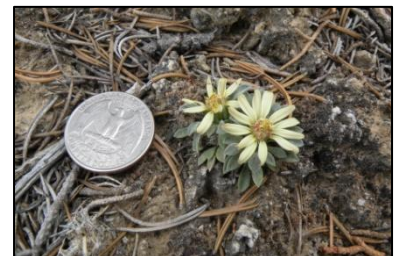
Last chance townsendia