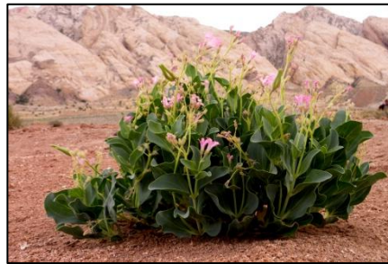
Jones cycladenia