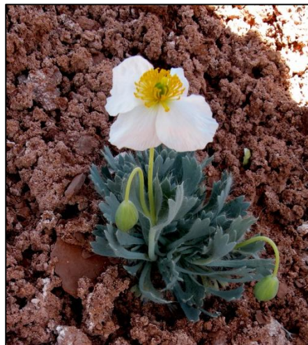
Dwarf bear-poppy