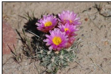
Uinta Basin hookless cactus Bekee Hotze, USFWS