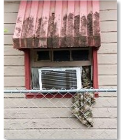
Figure 1: A home in Union Height (neighborhood in North Charleston) using a blanket as insulation.

In FY 2019, the EJ IWG Goods Movement Committee 8 partnered with EPA Region 4 and the Lowcountry Alliance for Model Communities 9 (LAMC) to host a working session and community resource fair to help the North Charleston community develop an actionable implementation plan. The goal of the plan was to improve community resilience and share key tools and resources with community members. Federal and state agencies shared resources related to the community's environment, health, housing, transportation, and economic opportunities. The EJ IWG NEPA Committee discussed the EJ IWG's Community Guide to Environmental Justice and NEPA Methods as well as the EJ IWG Promising Practices for EJ Methodologies in NEPA Reviews . The following tools were also shared: U.S. DOE's Weatherization Assistance Program ; U.S. DOE's Clean Energy for Low Income Communities Accelerator ; U.S. DOT's Safe Routes to Schools Activities; and U.S. EPA's College/Underserved Community Partnership Program .