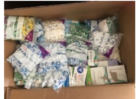
Figure 5: Insulin-related durable goods delivered to Puerto Rico.

The EJ IWG expanded its place-based disaster preparedness and response model to help vulnerable communities after Hurricanes Florence and Michael (discussed above) to include Puerto Rico in FY 2019. The EJ IWG's Rural Communities Committee (RCC) piloted a project to help communities in Puerto Rico manage chronic diabetes after the occurrence of a natural disaster. In the last several years, Puerto Rico has experienced several major hurricanes that have devastated the environment and left people with chronic diabetes especially vulnerable. 12 Diabetes is a contributor of morbidity and mortality during natural disasters, especially for vulnerable populations. 13 Knowing that medical supplies were needed for those with chronic diabetes, the RCC launched an effort to find out how to connect vulnerable populations with diabetes to the medical supplies that they needed.