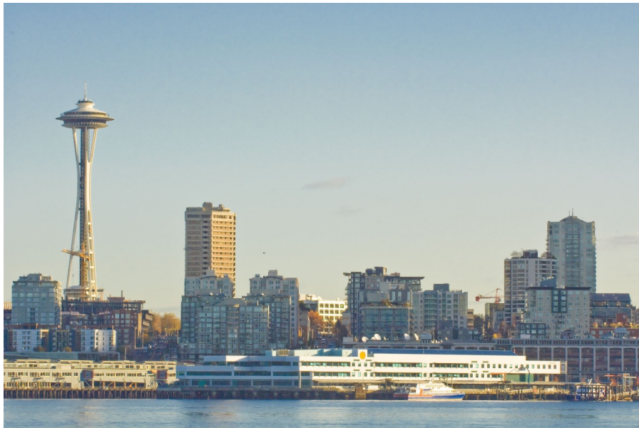
Figure 2: Photo of Seattle.

In FY 2019, EPA Region 10 assisted with developing, planning, and participating in the two training events with input from several Seattle community leaders. The first part was a 90-minute presentation, Primer on the National Environmental Policy Act and Environmental Justice. It introduced community members to NEPA, environmental justice and the EJ IWG. The second part was a 3-hour Workshop on Promising Practices for EJ Methodologies in NEPA Reviews. The training included an interactive hypothetical transportation infrastructure project to help participants explore how these two EJ IWG resources - Promising Practices for EJ Methodologies in NEPA Reviews and Community Guide to Environmental Justice and NEPA Methods - can support the consideration of EJ during various stages of the NEPA process. Development and planning efforts occurred throughout FY 2019 while the trainings took place in early FY 2020.