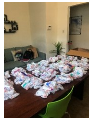
Figure 6: Insulin-related durable goods delivered to Puerto Rico.

To accomplish this, the EJ IWG worked with several partners, including EPA, USDA, FWS, Insulin for Life, Pediatrics Foundation of Puerto Rico, Medical Center of San Juan, Vieques House of Representatives, and medical practitioners in the United States and Puerto Rico. As a result of this public and private sector collaboration, the EJ IWG secured and transported insulin-related durable goods from Florida to Puerto Rico. Eleven distribution points were in overburdened and vulnerable communities across the island, including three pediatric foundations, and supplies were divided among doctors to help distribute the medical supplies for free, as needed. These efforts in Puerto Rico are ongoing, and the EJ IWG plans to expand the network of partners to leverage more resources to help vulnerable communities affected by natural disasters address their health concerns.