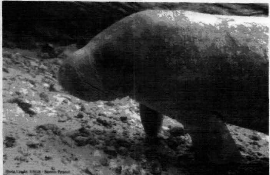
In response to requests for consultations from the U. S. Coast Guard with regard to manatees and sea turtles, the South Florida Office of the U. S. Fish and Wildlife Service has provided guidance about events such as firework displays, regattas, boat parades and races, and fishing tournaments.

The provision under section 7 that is most often associated with the Service and other Federal agencies is section 7(a)(2). It requires Federal agencies to consult with the Service to ensure that actions they fund, authorize, permit, or otherwise carry out will not jeopardize the continued existence of any listed species or adversely modify designated critical habitats. The