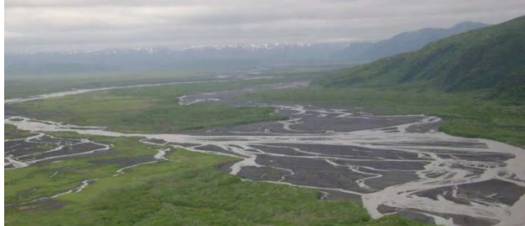
Long Beach River, Anchor Bay, within Alaska Peninsula NWR.

management. The acquisitions will reduce habitat fragmentation and will facilitate the Service's efforts to control invasive species. The exchange at Alaska Peninsula NWR established the eastern bank of the Long Beach River as the eastern boundary of the Refuge, creating a clear boundary between Refuge lands and Alaska Native Corporation lands, which will reduce trespass issues. The land exchange also provided the only feasible access to the Native Corporation lands in the upper Kametook River area, improving land management.