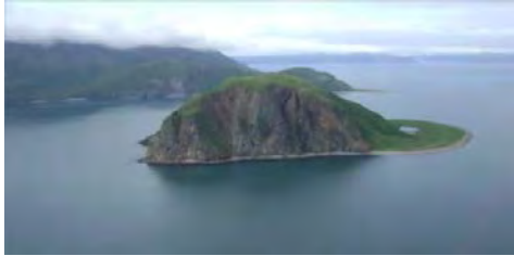
Chiachi Island is in the background and Shapka Island, part of the Alaska Peninsula NWR, is in the foreground.

The Alaska Peninsula and Alaska Maritime NWRs recently completed land exchanges with two Alaska Native Corporations. At Alaska Maritime NWR, land exchanges significantly improved management of the Jacob, Paul, and Chiachi Islands by eliminating mixed ownership and consolidating land