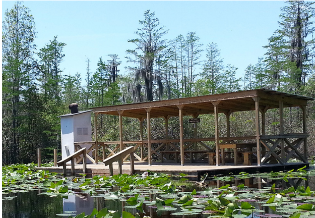
Big Water Shelter

Recreational drone (UAS) use is prohibited.