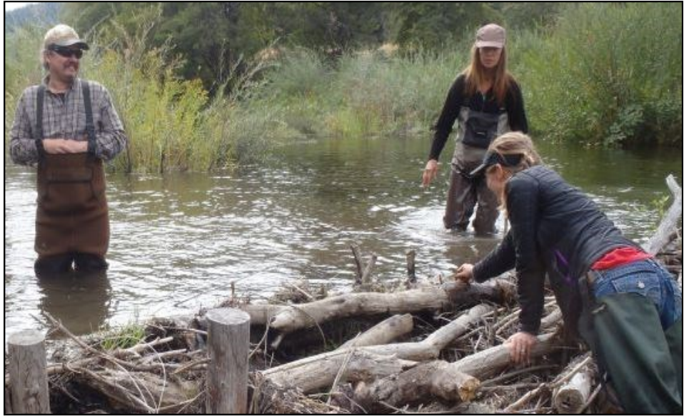
Above: Sugar Creek BDA after construction created an upstream pool.