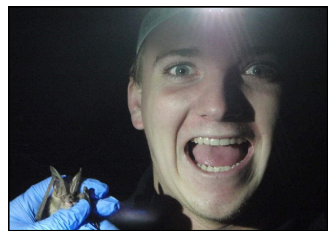
2018 Summer/Fall Newsletter - 8