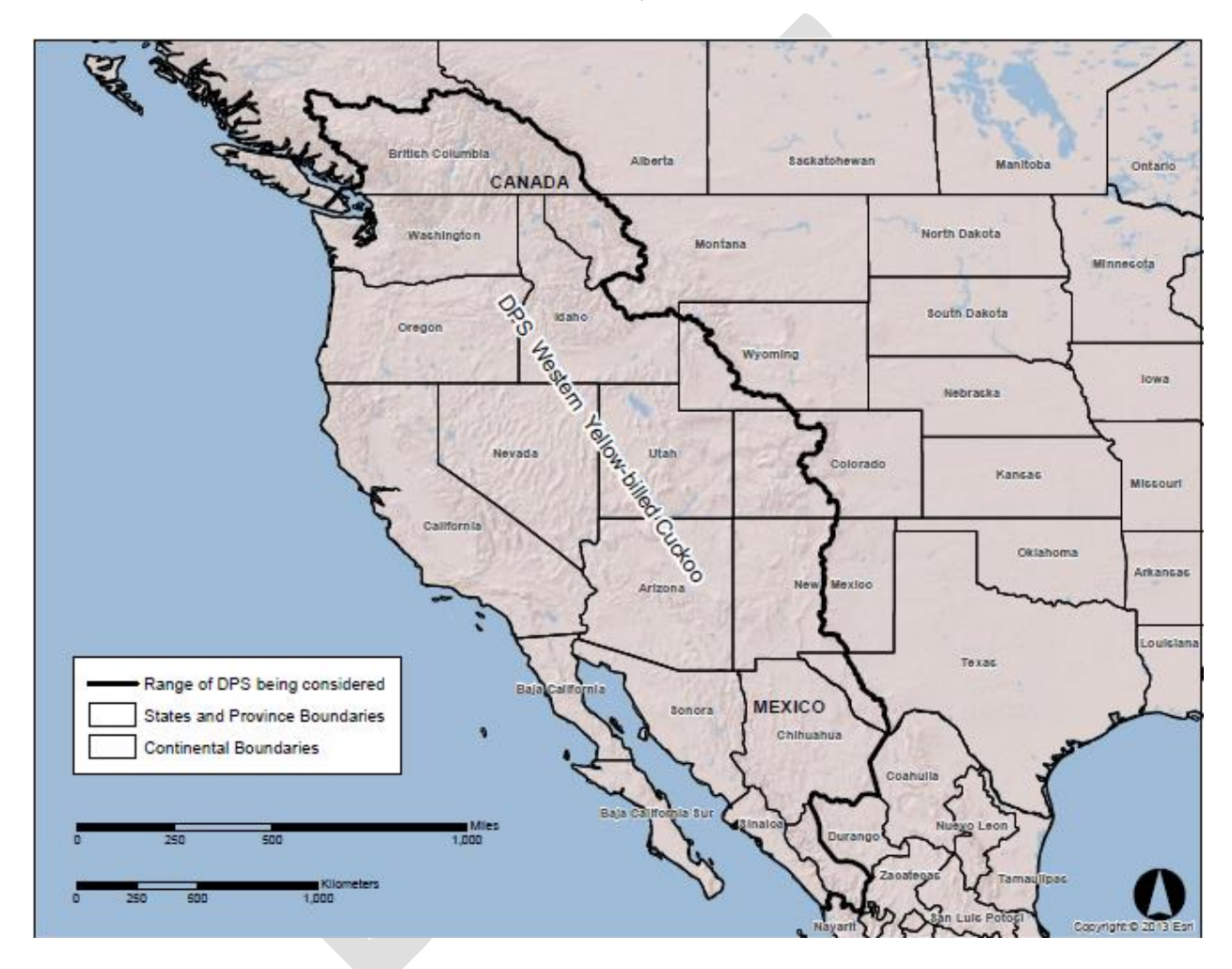
Figure 1. Range of the western Distinct Population Segment of the Yellow-billed Cuckoo.

Verde River, Gila River, Santa Cruz and San Pedro river watersheds, as well as multiple restoration sites along the lower Colorado River (Corman and Magill 2002, Halterman 2009, Johnson et al. 2010, McNeil et al. 2013). In New Mexico they breed on the Gila River and the middle Rio Grande (Stoleson and Finch 1998, Woodward et al. 2002, Ahlers and Moore 2012). In Colorado there are small numbers along the Colorado River and upper Rio Grande (Beason 2010). There are no known breeding populations in Oregon (Marshall et al. 2003). In Idaho there is reported breeding on the Snake River (Cavallaro 2011). In Nevada they may occasionally breed on the Carson, Virgin and Muddy Rivers (Halterman 2001, McKernan and Braden 2002, Tomlinson 2010, McNeil et al. 2013).