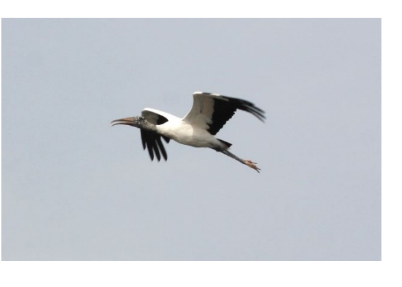
Wood Stork In Flight

Wood storks are federally listed as a threatened species and are protected throughout their range. The main threat to the wood stork is the loss of foraging and breeding habitat due to disruptions in natural water flow in their preferred habitats.