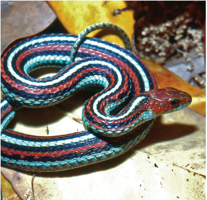
San Francisco garter snake

If imperiled plants and animals lack a known benefit to mankind, should we care if they disappear? If a species evolves over millennia or is created by divine intent, do we have a right to cause its extinction? Would our descendants forgive us for exterminating a unique form of life? Such questions are not exclusive to scientists or philosophers. Many people believe that every creature has an intrinsic value. The loss of plant and animal species, they say, is not only shortsighted but wrong, especially since an extinct species can never be replaced. Eliminating entire species has been compared to ripping pages out of books that have not yet been read. We are accustomed to a rich diversity in nature. This diversity has provided inspiration for countless writers and artists, and all others who treasure variety in the natural world.