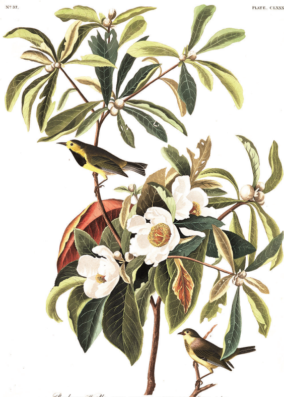
John J. Audubon

Among its many values, wildlife is a source of inspiration. For example, the bird paintings by John James Audubon, such as this image of Bachman’s warblers, are recognized as fine art. The species is known as the rarest songbird native to the U.S. ivory-bill was rediscovered recently in Arkansas.