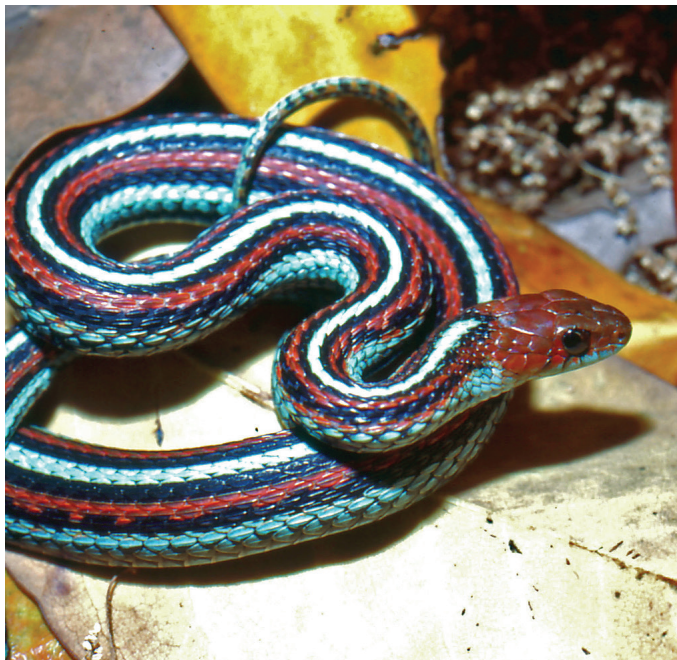
San Francisco garter snake

If imperiled plants and animals lack a known benefit to mankind, should we care if they disappear? If a species evolves over millennia or is created by divine intent, do we have a right to cause its extinction? Would our descendants forgive us for exterminating a unique form of life? Such questions are not exclusive to scientists or philosophers. Many people believe that every creature has an intrinsic value. The loss of plant and animal species, they say, is not only shortsighted but wrong, especially since an extinct species can never be replaced. Eliminating entire species has been compared to ripping pages out of books that have not yet been read. We are accustomed to a rich diversity in nature. This diversity has provided inspiration for countless writers and artists, and all others who treasure variety in the natural world.