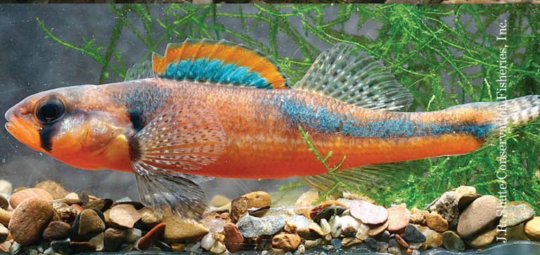
J.R. Slute/Conservation Fisheries, Inc.