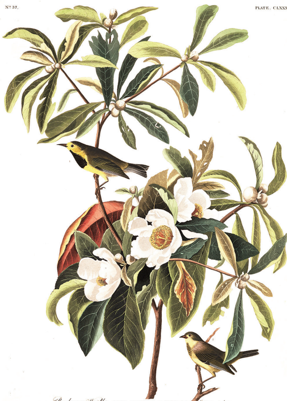
John J. Audubon

Among its many values, wildlife is a source of inspiration. For example, the bird paintings by John James Audubon, such as this image of Bachman's warblers, are recognized as fine art. The species is known as the rarest songbird native to the U.S. ivory-bill was rediscovered recently in Arkansas.