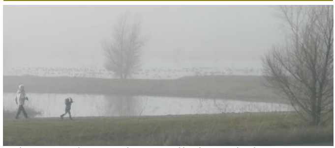
Take a 1-mile round trip walk through the wetlands and visit a second observation mound at the halfway point.

Sacramento National Wildlife Refuge Complex 752 County Road 99W Willows, CA 95988 Phone: 530 934 2801 www.fws.gov/refuge/north_central_valley/ llano seco unit