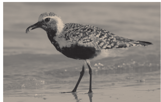
Black Bellied Plover