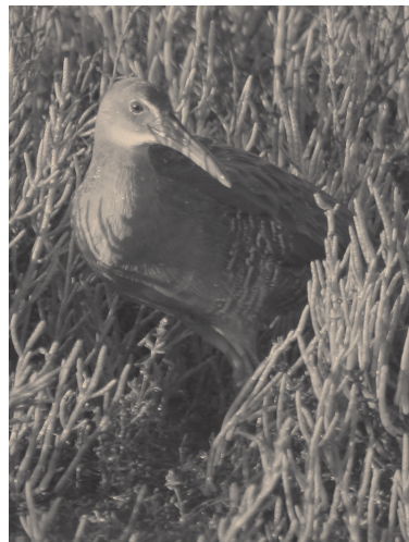
Light-footed Clapper Rail