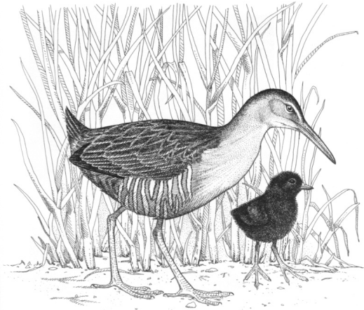
Light-footed Clapper Rail

The refuge is designated a "Globally Important Bird Area" by the American Bird Conservancy and during winter months has one of the highest concentrations of raptors anywhere in the U.S.. More than 200 species of birds can be found within the refuge and on adjoining Navy lands including the endangered light-footed clapper rail, CA least tern, CA brown pelican, and Belding's Savannah Sparrow.