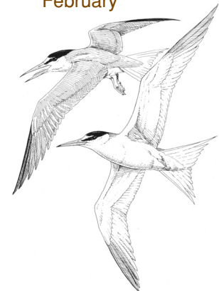
California Least Terns